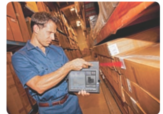
Maintain inventory and track assets with the integrated barcode scanner.

The Motion F5v comes standard with Corning® Gorilla® Glass , offering advanced display protection, perfect for real-world mobile work environments. Add 180-degree viewing angles, Hydis AFFS+ LED backlit display and View Anywhere® technology for reduced reflectance and glare, and you get the best tablet PC viewing experience available for outdoor use.