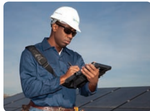
Take the F5v with you no matter where your work takes you.

Don't worry. The F5v brought its hard hat. Tested and proven to withstand field-ready conditions such as dust, heat and rain, the Motion F5v is ready to work wherever you're working. The strong internal magnesium frame and solid state drive (SSD) protect your data against drops and bumps. Fully-sealed, the F5v is protected against the elements and easily cleaned.